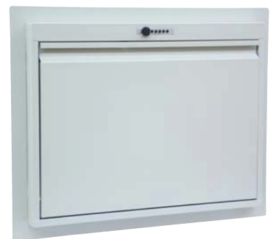
SKU # CWD-1478