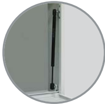
SKU # CWD-1557