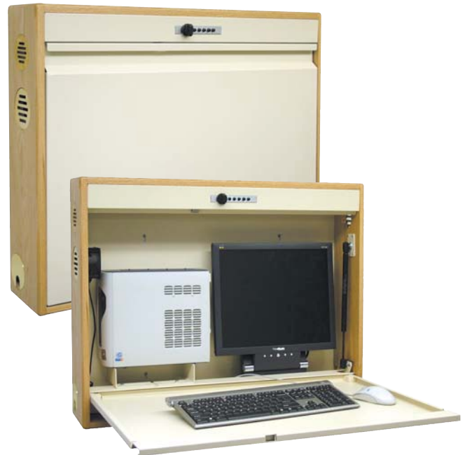
SKU # CWD-1455