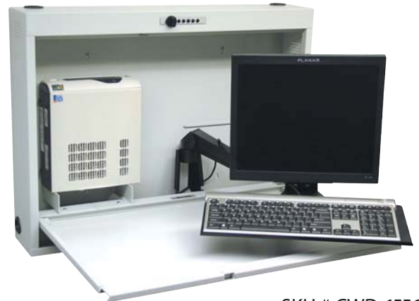
SKU # CWD-1556-AA Shown with # AA-1475