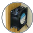
18 CFM Exhaust Fan