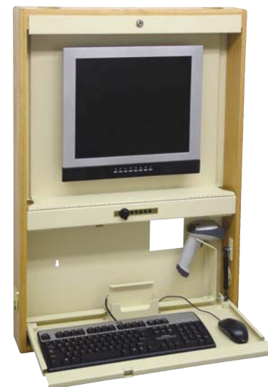
Wood Trim Work Center SKU # CWD-1445