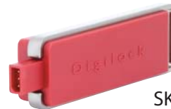
SKU # PK-1591

Programming Key is needed to initiate lock and to add manager Keys. Programming key