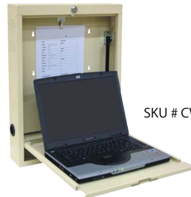
SKU # CWD-1559