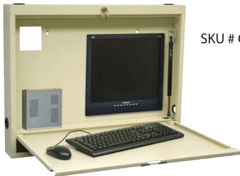
SKU # CWD-1512