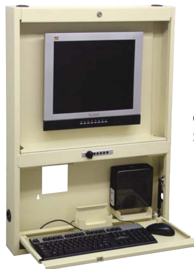
Contemporary Work Center SKU # CWD-1440