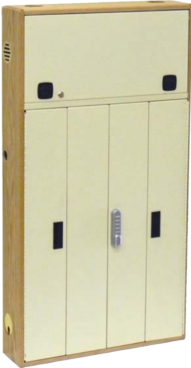
SKU # CWD-1495