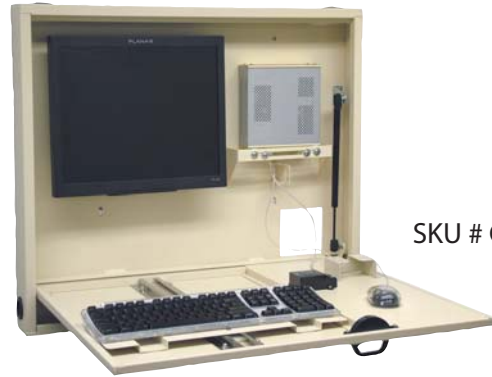
SKU # CWD-1470