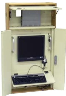
Keyboard Tray Tilted