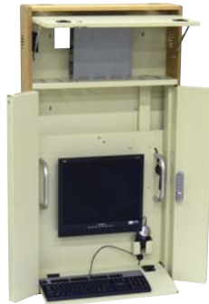
Keyboard Tray Down