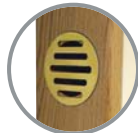
Brass Vent Cover