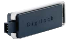
SKU # PK-1592

Programming Key is needed to initiate lock and to add manager Keys. Programming key