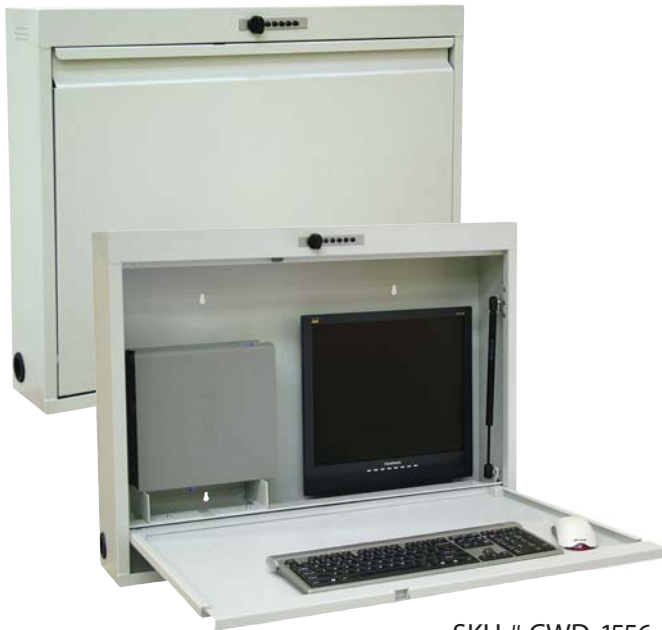
SKU # CWD-1556