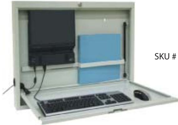
SKU # CWD-1511