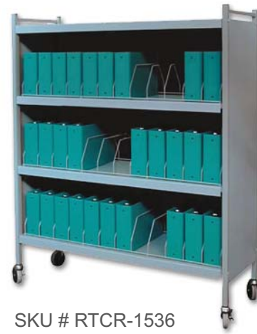
SKU # RTCR-1536