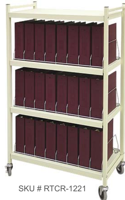
SKU # RTCR-1221