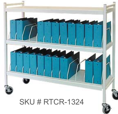
SKU # RTCR-1324