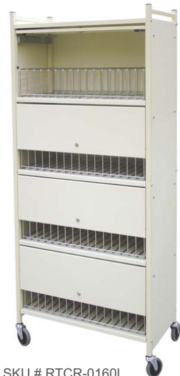
SKU # RTCR-0160L