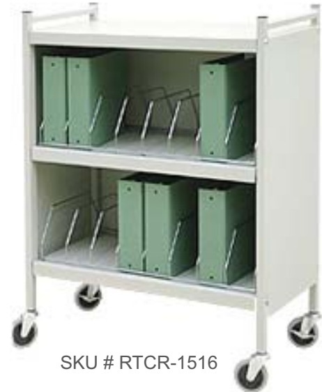
SKU # RTCR-1516

LOCKING PANELS FOR CABINET STYLE RACKS DESIGNATED BY "L"