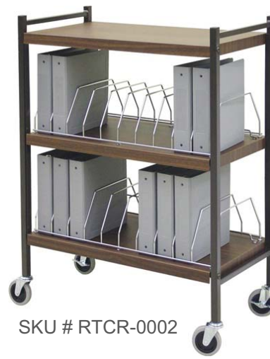
SKU # RTCR-0002