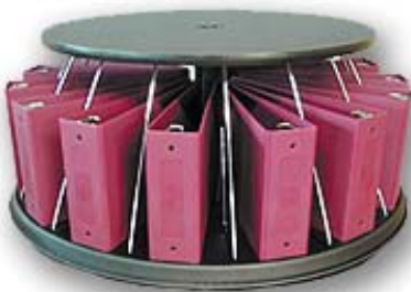
SKU # RTBC-30CT