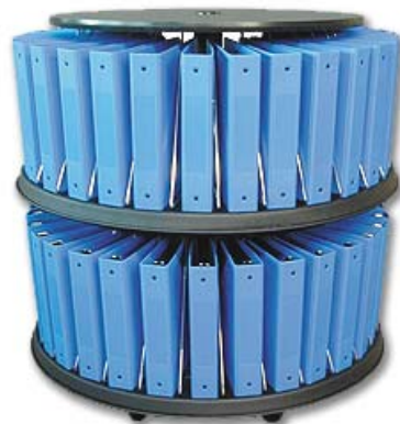
SKU # RTBC-60CT